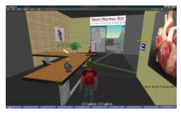
Figure 1 – Screenshot from the 'Heart Murmur Sim - Cardiac Auscultation Training Concept' educational virtual world created in Second Life that allows visitors (clinical students) to tour a virtual clinic and test their skills at identifying the sounds of different types of heart murmurs, based on sound files from McGill University's Virtual Stethoscope (http://sprojects.mmi.mcgill.ca/mvs/mvsteth.htm).

Educause has pages dedicated to Second Life (e.g., http://connect.educause.edu/taxonomy/term/2174/0), which has also been the focus of many recent